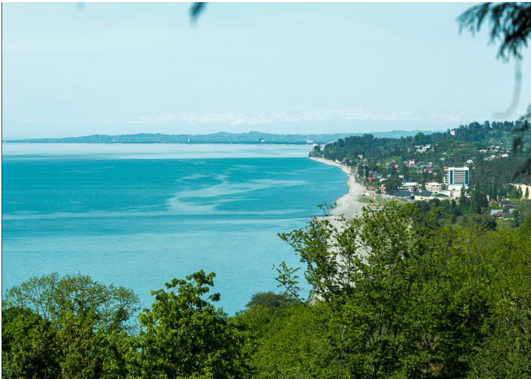
CHAKVI See View